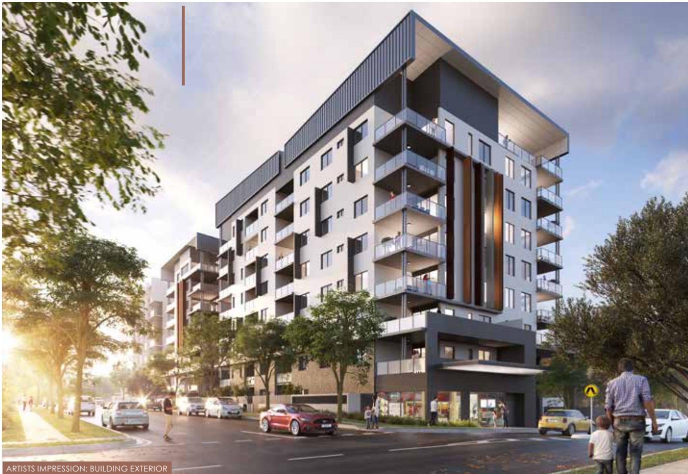
ARTISTS IMPRESSION: BUILDING EXTERIOR