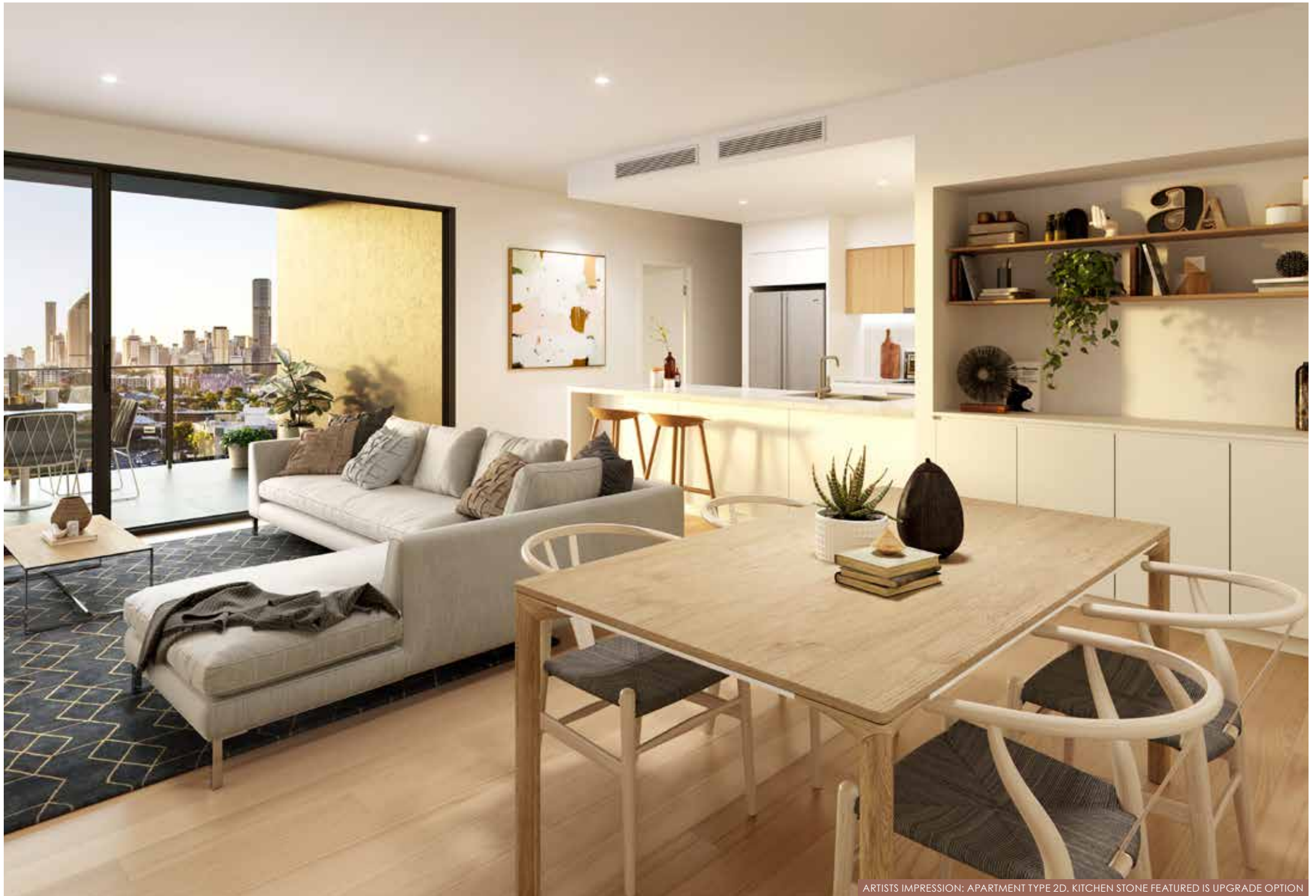
ARTISTS IMPRESSION: APARTMENT TYPE 2D. KITCHEN STONE FEATURED IS UPGRADE OPTION