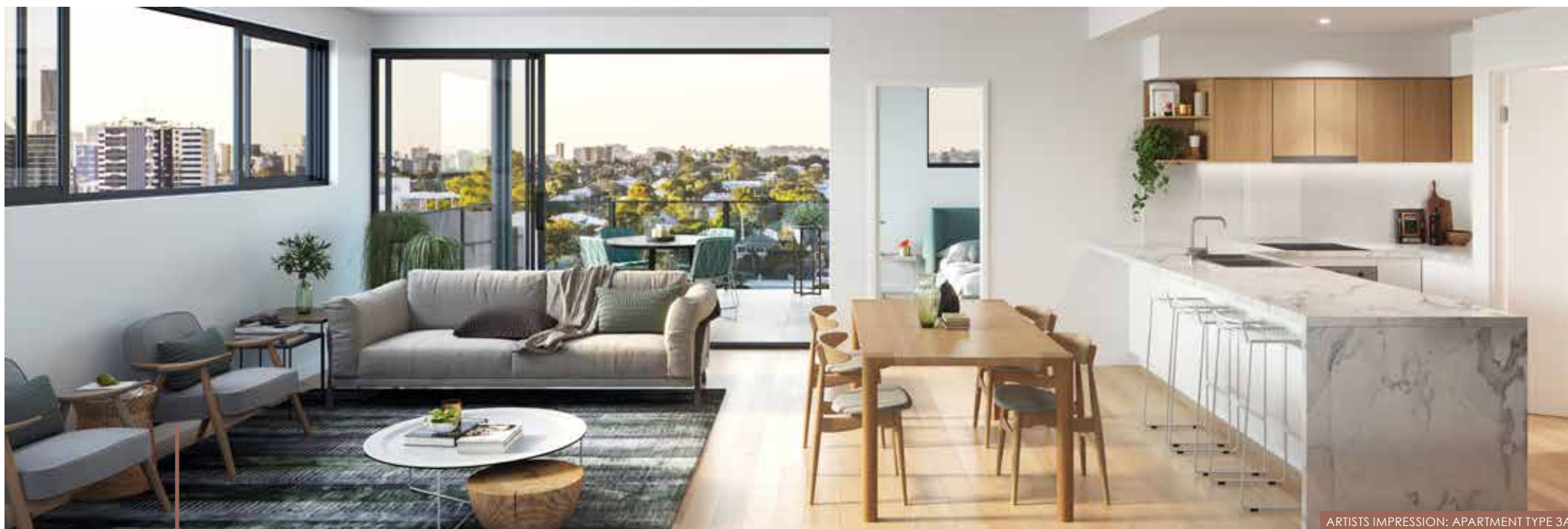
ARTISTS IMPRESSION: APARTMENT TYPE 3A