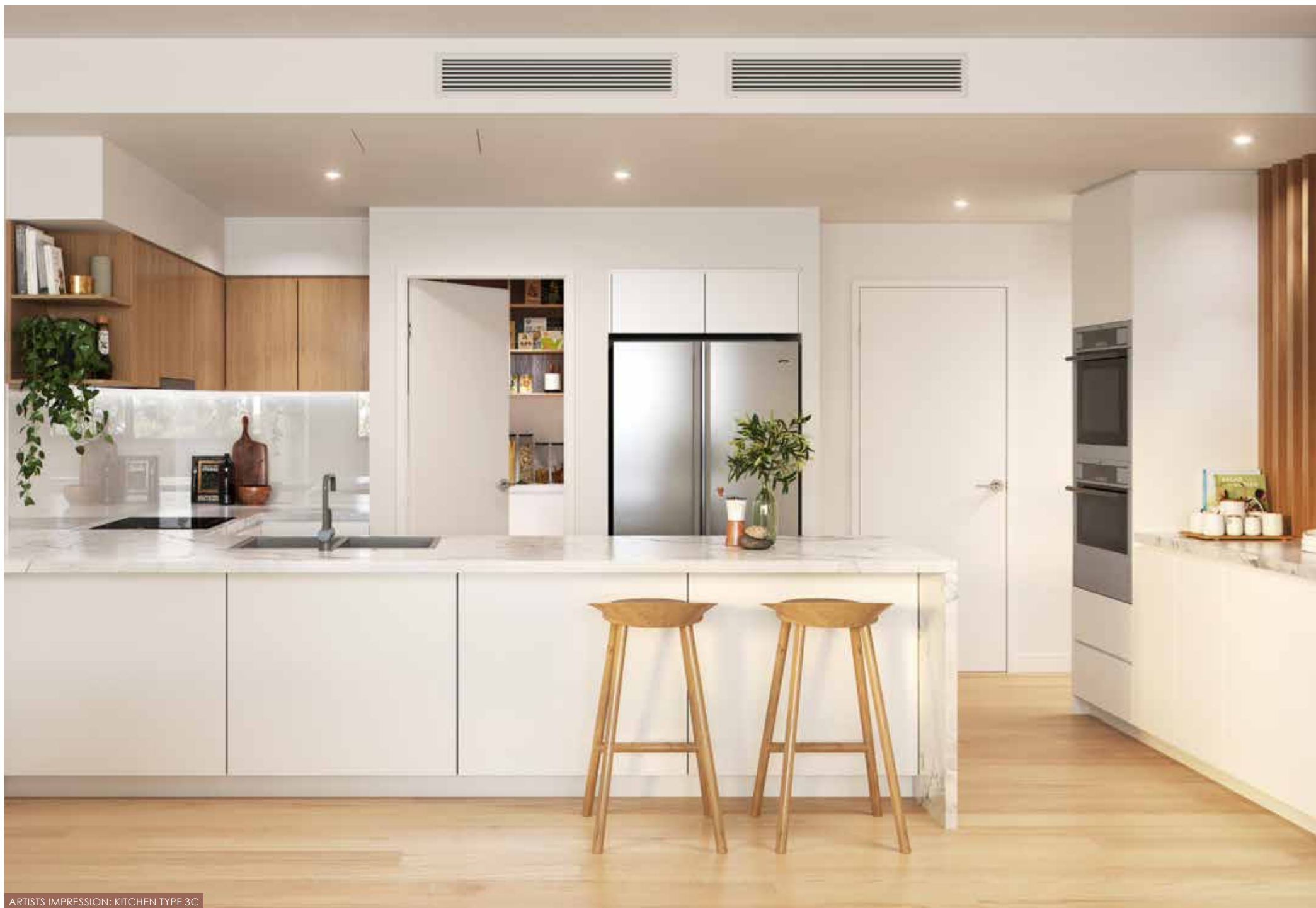
ARTISTS IMPRESSION: KITCHEN TYPE 3C