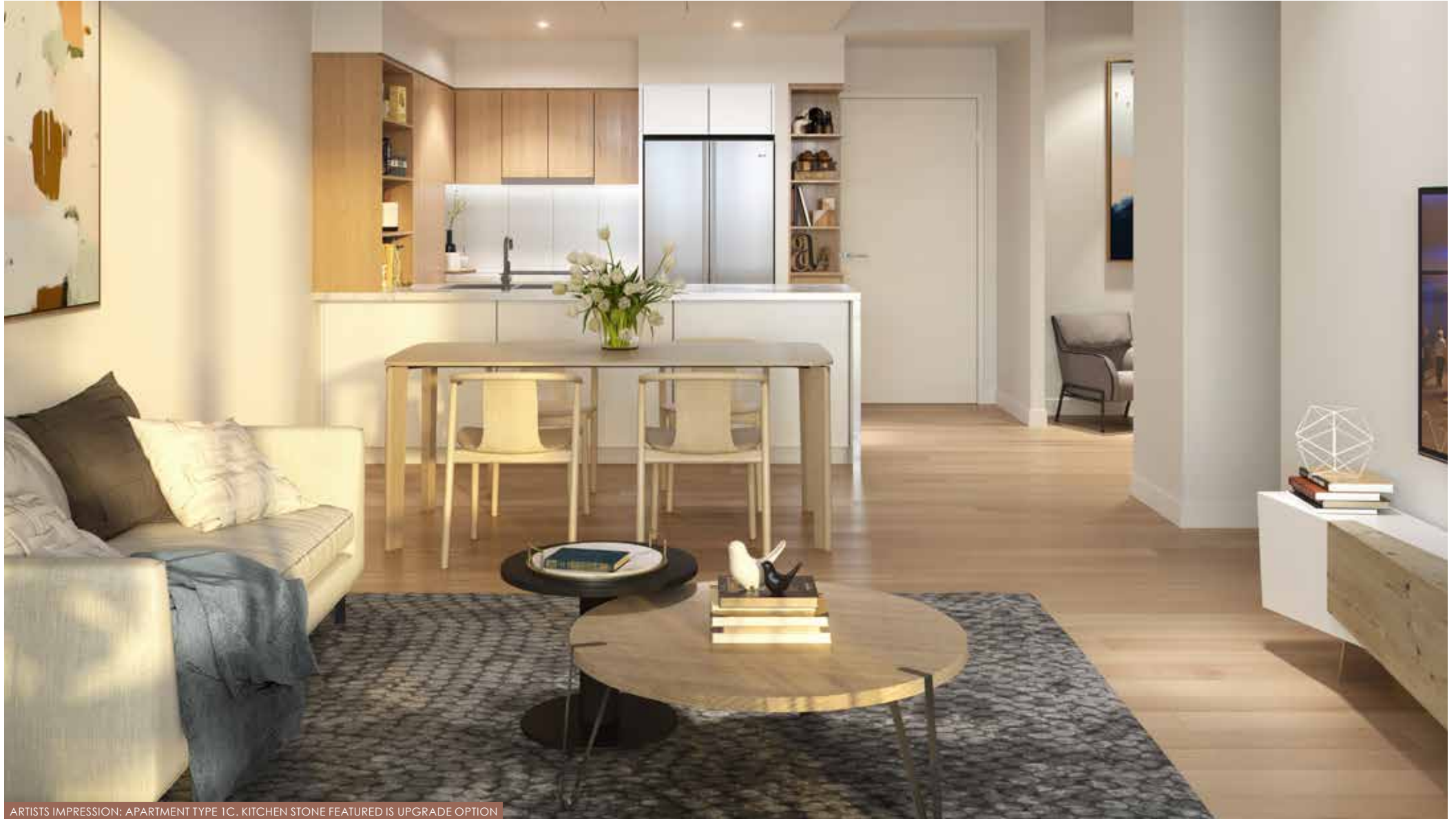
ARTISTS IMPRESSION: APARTMENT TYPE 1C. KITCHEN STONE FEATURED IS UPGRADE OPTION