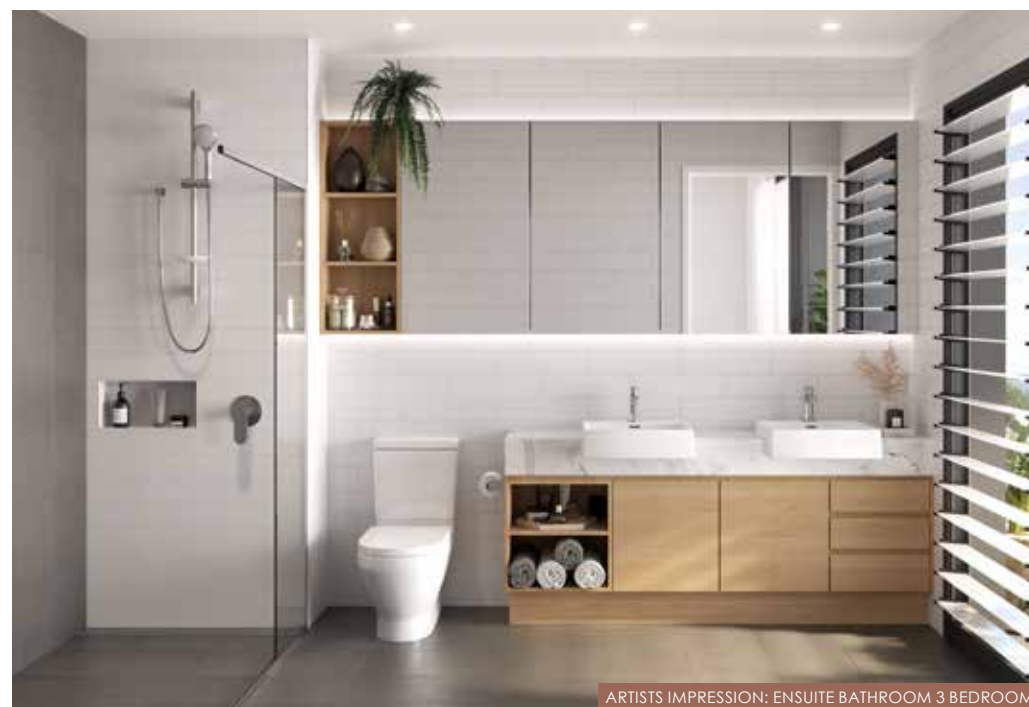
ARTISTS IMPRESSION: ENSUITE BATHROOM 3 BEDROOM

The open plan designs are cleverly conceived combining functionality, deluxe finishes and open plan living which flows seamlessly from interior to outdoors to take in the available city and urban views.